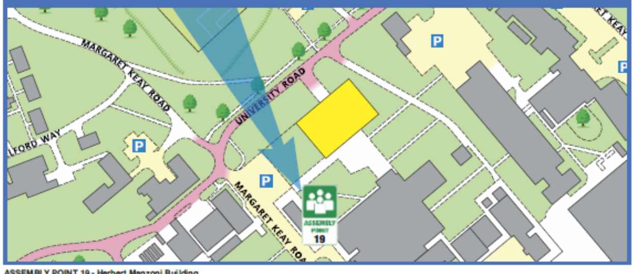
ASSEMBLY POINT 19 - Herbert Manzoni Building

Assembly point 19 is allocated to this building which is shown in yellow